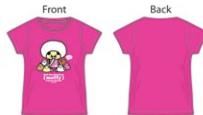
MF4801-09 (Soft Marshmallow Maffly & Friends On Pink Base)

Size: Men and Woman Sizes (Small, Medium, Large, Extra Large) Details: Basic Color Tees, 100% Cotton Packaging: Clear Polybag