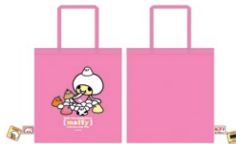
MF0801-09 (Maffly & Friends On Pink Base Canvas Bag)

Size: 295 x 312 x 485mm Print: 4C x 4C Material: 12oz Canvas Details: Cloth Tag -Embro 2c x 1c Hang Tag -4C x 4C