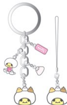
MF1201-09 (Maffly And Friends Keychain & Mobile Charm Set)

Material: Key Ring - Stainless Steel Chain - Stainless Steel Finishing: 4 pcs of zinc alloy and iron stamped in soft enamel finish with zipper pull clips Details: Comes with mobile phone strap -3 extra black string mobile straps for optional usage Packaging: 4C x 4C, 350gsm artcard backing -inserted into a clear PP bag