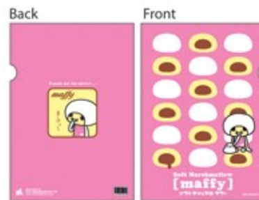
MF0101-09 (Maffly Double Taste Folder)

Size: 220 x 315mm Print: 4C x 4C Finishing: Gloss or Matt Finishing Details: Translucent / Transparent PP 6P free , Eco-Friendly