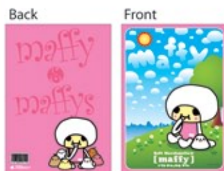
MF1701-09 (Maffly Relax Notebook)

Size: 207 x 307mm Print: 4C (350 gsm) (Cover) Packaging: Shrink Wrapped Details: Glue Bind Finishing: Matt Lamination Spot UV (Cover)