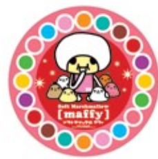
MF0501-09 (Maffly Rainbow Mouse Pad)

Size: 180 x 210mm Material: Rubber with PVC Coating Finishing: Matte Lamination Packaging: Clear Polybag